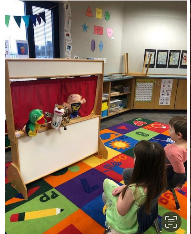
P is for Puppet Show

FREE AND REDUCED STATUS APPLIES TO SUPPLIES /LUNCH FEES, BUT NOT TUITION.